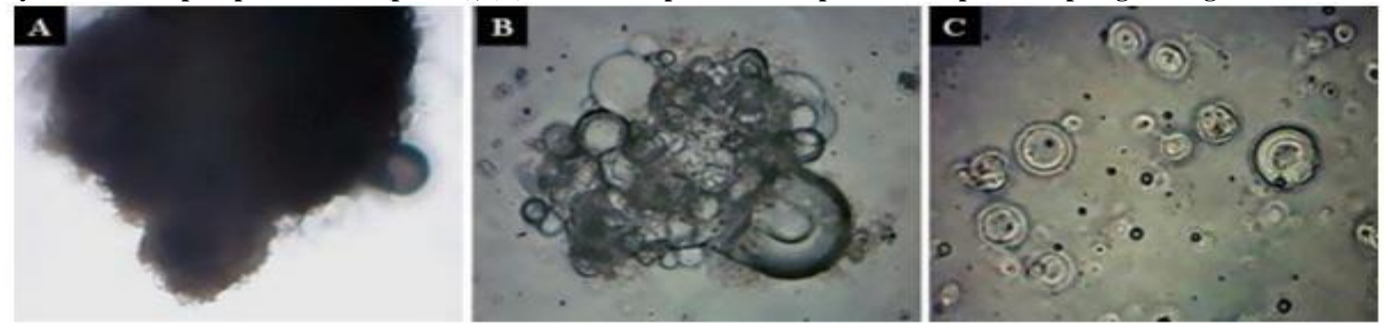
Fig 2. Optical microphotograoh showing (A) proniosome powder, (B) formation of vesicles on maltodextrin after hydration with phosphate buffer (pH 6.8), (C) noisome dispersion from proniosome powder upon gentle agitation